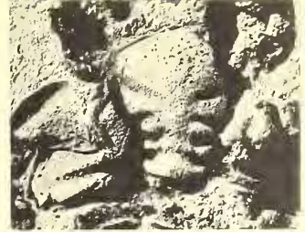
2 x 3.5